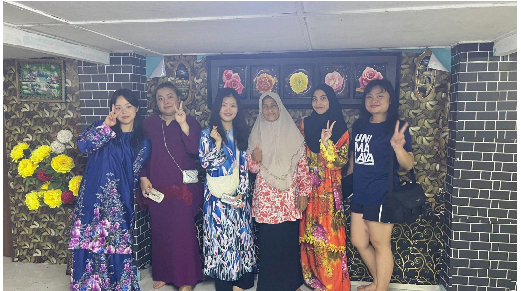
The Students dressed in traditional Malay attire

As FCSIT continues to drive innovation and collaboration through programmes like AESEP, Universiti Malaya remains steadfast in its mission to nurture future-ready, globally competent digital leaders. This initiative not only strengthens academic networks but also lays the foundation for deeper international partnerships in the years to come.