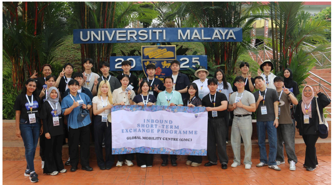
In front of the iconic "UNIVERSITI MALAYA"

This initiative reflects FCSIT's continued commitment to nurturing global tech talents and enhancing international collaboration in the field of emerging technologies. The AESEP is not only a platform for academic growth but also a step forward in cultivating a new generation of responsible and innovative AI practitioners.