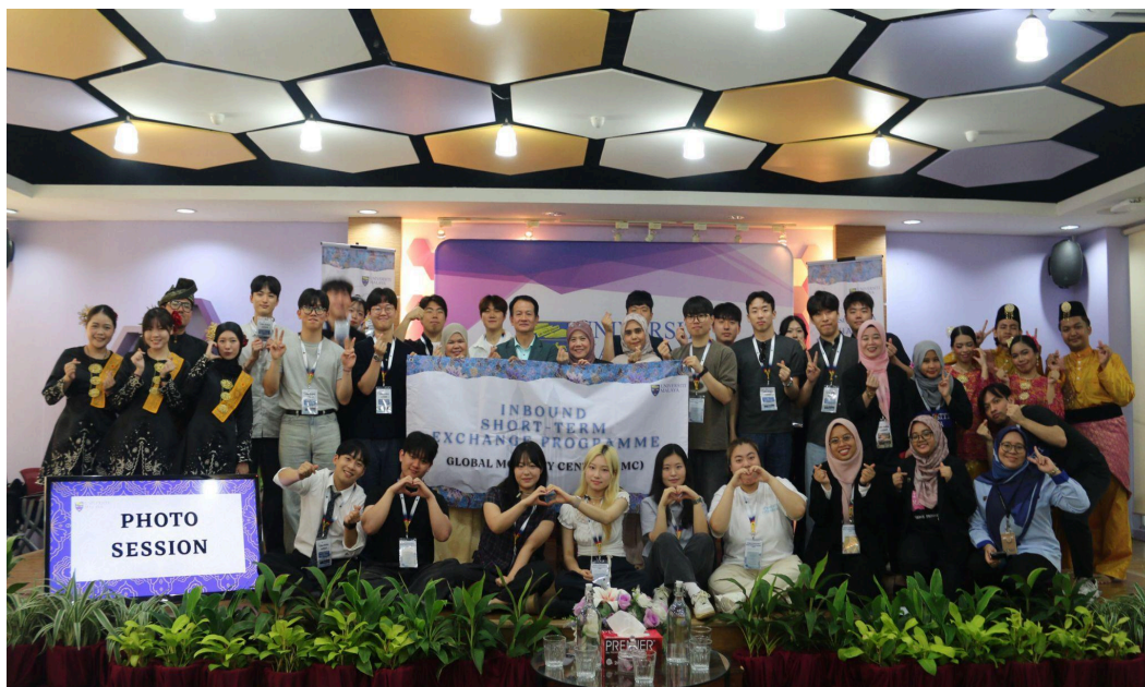
Photo Session with students from INHA Technical College, Korea

AI & Data Excellence Summer Enrichment Programme (AESEP), Faculty of Computer Science and Information Technology, UM